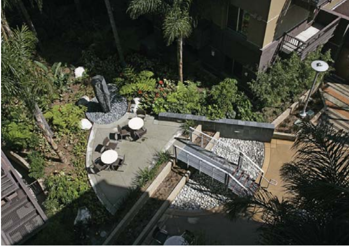
▲ Eight-foot-tall columns of natural stone grace the sitting areas of two planted courtyards at the upper level. Dripping water enhances the rough texture of one and highlights the smooth, twisting surface of the other.