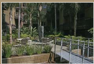
Landscape Architect: TGP, Inc. Architect: Togawa Smith & Martin Residential Location: Los Angeles, California, USA Completion: 2008

Mura, which means 'little village' in Japanese, is a 190-unit luxury condominium project in downtown Los Angeles, adjacent to Japan town. Despite its proximity to Japan town, the developer reports that 95% of the buyers are Korean, many of them small business owners in the downtown area, or parents that purchased the units for children attending the University of Southern California. Also, a development across the street is comprised of 80% Korean owners.