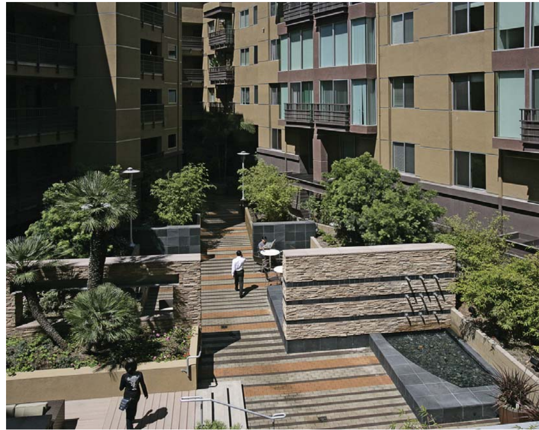
▲ The main pedestrian circulation spine at Mura is paved in a richly woven contemporary carpet with interlocking concrete pavers in four colors in a repeating pattern. This promenade ties together three large courtyards and a pool area, all located on the podium level one floor above the street.