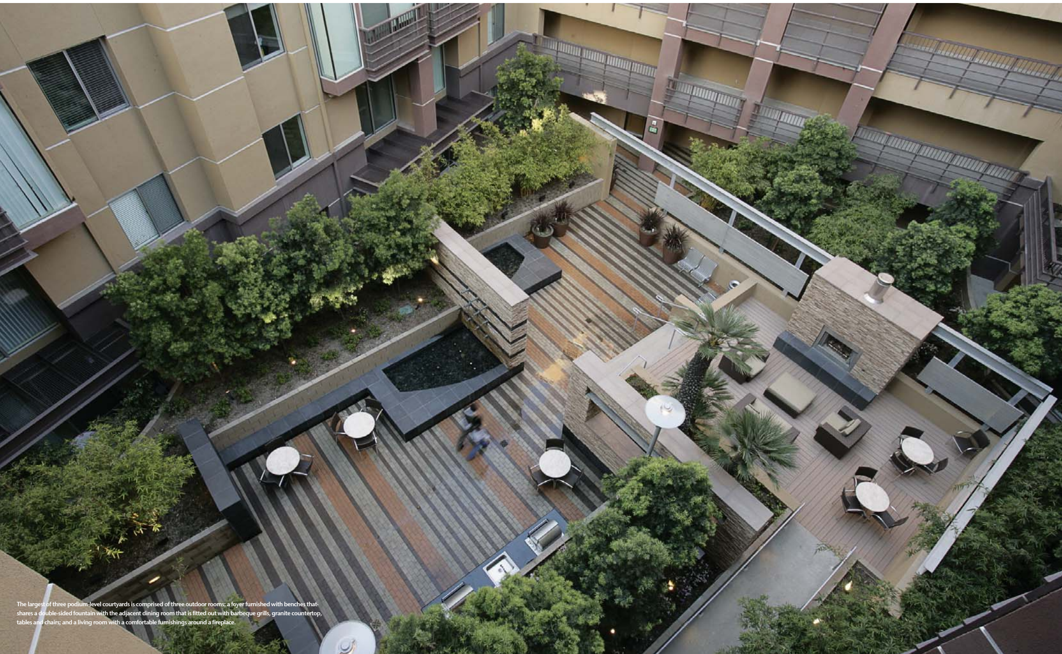
The largest of three podium-level courtyards is comprised of three outdoor rooms: a foyer furnished with benches that shares a double-sided fountain with the adjacent dining room that is fitted out with barbeque grills, granite countertop, tables and chairs; and a living room with a comfortable furnishings around a fireplace.