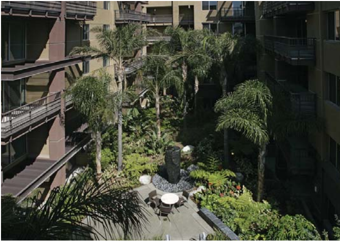
▲ Lush plantings of 18- to 30-foot-tall Fishtail and Queen palms in the two large courtyards provide the surrounding units with a landscape view as well as privacy.